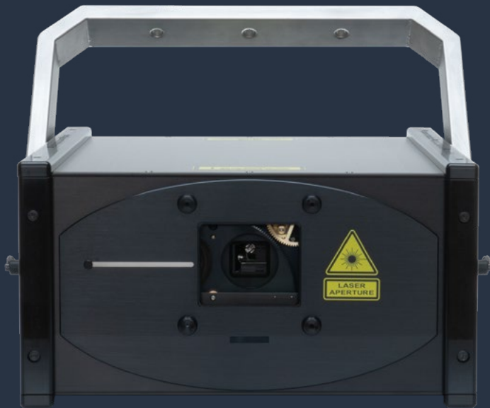
PHAENON XD COMPACT HOUSING